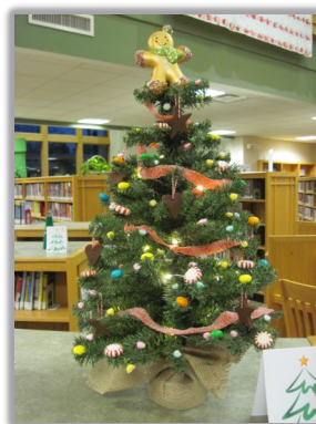
First Place Mini-Tree by the Beach Family