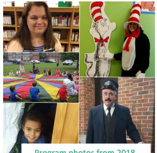
Program photos from 2018.

Programs were both plentiful and well attended: 13,038 people came to 480 free programs at the library.