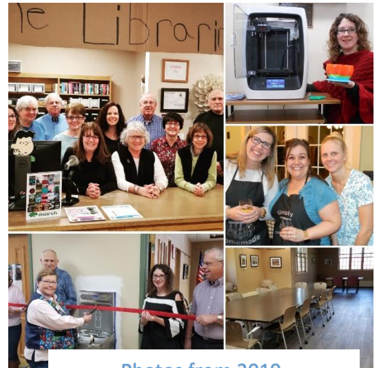
Photos from 2019.

Programs were both plentiful and well attended: 13,952 people came to 527 free programs at the library.