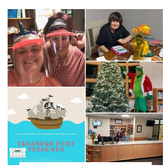
Scenes from 2020

To keep our community engaged and learning, we quickly instated online programming and have become a leader in the library world for our active use of Zoom to provide live programs. Programs were both plentiful and well attended: 6,135 people came to 275 free programs at the library and online via zoom.