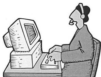
Uploading to her MP3