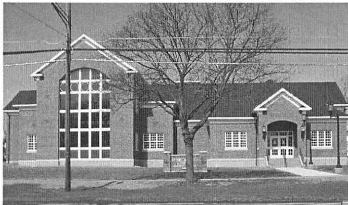
The New Seneca Falls Library