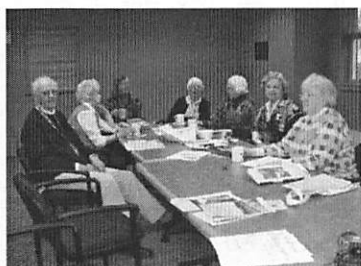
Myndwich on a recent Wednesday