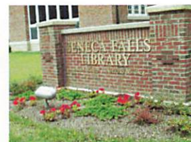
Geraniums adorn the sign.

The Garden Club meets at the Library on the third Monday of each month at 2:00pm. Visitors and new Members are welcome!