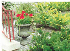
Thank you to the Garden Club for adding color to our new bushes and lawn.

Gratitude of the Seneca Falls Library goes to the Garden Club. The flowers and the planters add so much to the entrances. And, now we have trees and shrubs, grass too!