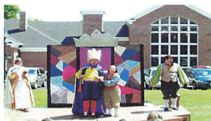
Merry-Go-Round Youth Theatre "The Emperor's New Clothes"

The library has seen a marked increase in usage since our new building opened last November. We have added 1,516 cardholders since then for a total of 5,901. Our number of weekly visits is 783 and we average 185 people on our computers a week. We are now open 60 hours a week – 20 more than at our old building – making us more accessible to those who want to visit after work or on the weekend.