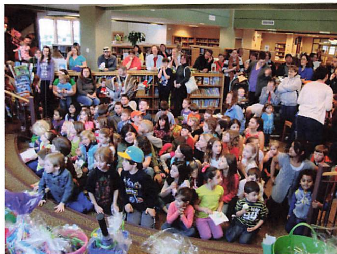
Participants of one of our many wonderful children's programs.

Library use is at an all time high! We had 75,674 visits to the Seneca Falls Library in 2013. That is up from 49,220 in 2012!