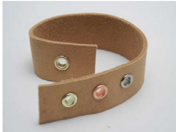
[Photo 7: "Finished" side of eyelets shows on "Smooth" side of work material.]